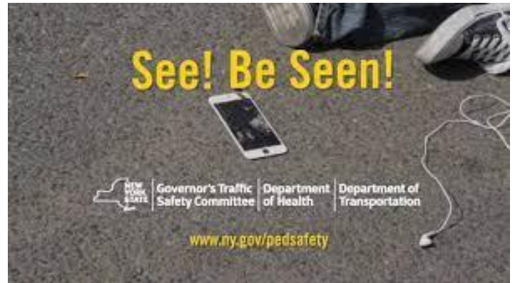
"See! Be Seen!" Public Service Announcements

Adequate, safe and affordable transportation is critical to an age-friendly community. Safe streets, sidewalks, and crosswalks are essential as are alternatives to driving for those who need to move around the community for access to services and for social and civic participation.