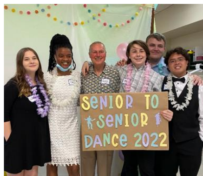
Intergenerational Dinner Dances in Vestal and Johnson City