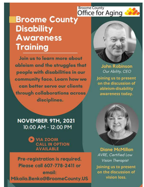
Disability Awareness Training