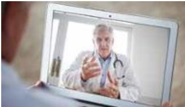
Telehealth Cart at Eastern Broome Senior Center in Harpersville