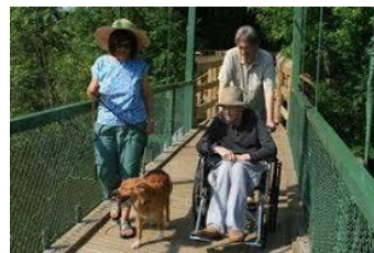
BMTS E-Bike & E-Scooter Multi-Use Trail Regulations Guide