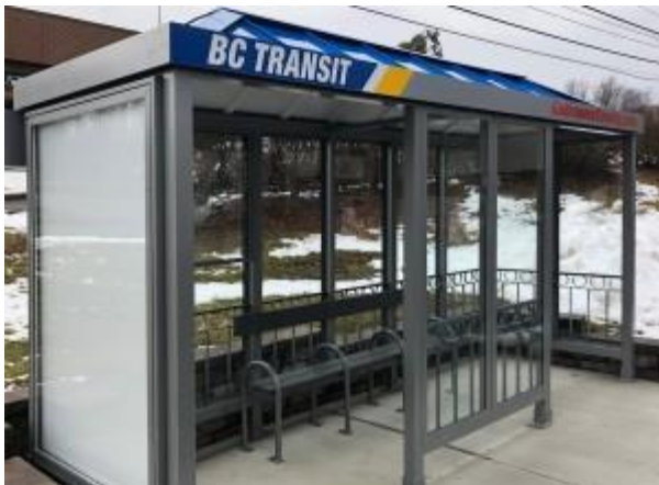
BC Transit Bus Shelters