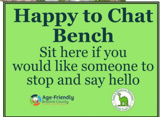
Happy to Chat Bench Project (Otsiningo Park, Roundtop Picnic Area, and Deposit)