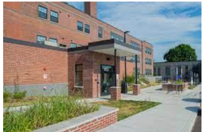
New housing (clockwise from top left: Skye View Heights, Endicott Square, Fairmont Park Apartments)