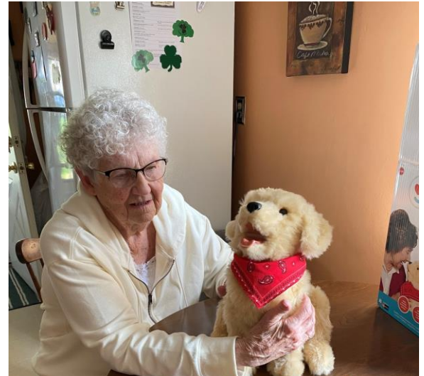
Robotic Companion Pet Project

People need accessible and affordable health services and appropriate community supports.