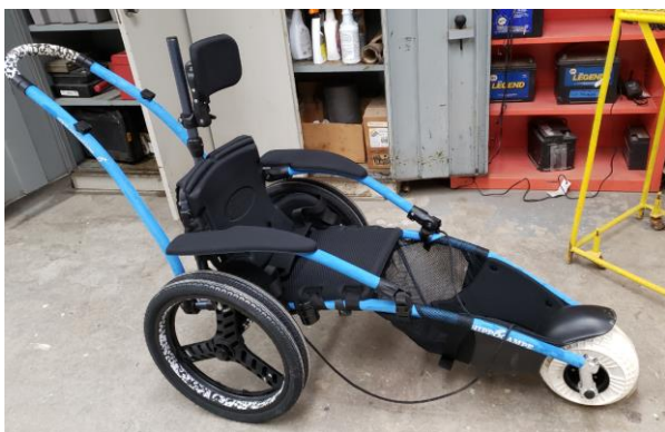
All-Terrain Beach Wheelchair Part of Pathways to Play: Dorchester Park Accessibility Improvements