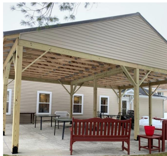
Broome West Senior Center Pavilion