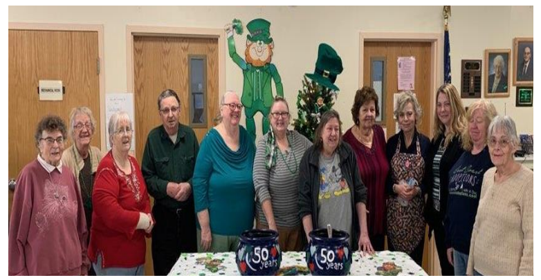
Eastern Broome Senior Center celebrating 50 years of Nutrition Programming.

Broome County Senior Centers & Congregate Meals Program –Since returning the centers to full operation status after the Covid pandemic shut down, we have added new programming and many new faces. The senior picnics held at each center in the summer of 2022, were well received and brought participants much excitement. The picnics were attended by many older adults who didn't visit the centers before. The centers remain a hub of activity with physical wellness programs such as Bone Saver exercise, Tai Chi, chair exercise, line dancing and much more. New programming such as Binghamton University Balance Clinics, Bingosize, Lyceum Armchair