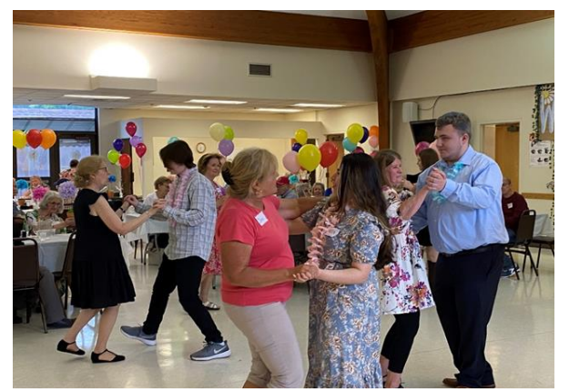
JC High School Students dance with older adults at the Senior-to-Senior Dance hosted at JC Senior

a group at a rural center to paint giftbags and fill the bags with spring/Easter items for a nearby Head Start Program. At the Deposit Senior Center an intern hosted a candy making activity that drew in new attendees. In the month of May, the Johnson City Senior Center collaborated with Johnson City High School students and other agencies to host an intergenerational dance attended by 86 older adults and supported by dozen students. To encourage healthy activities an evidence-based program Walk with Ease Program was offered