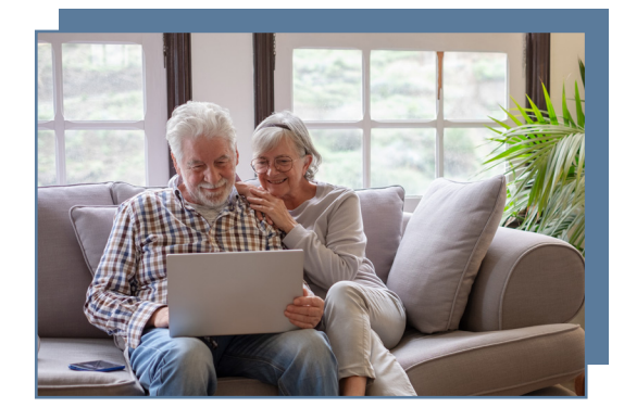
To view the Senior News and access online materials visit www.gobroomecounty.com/senior