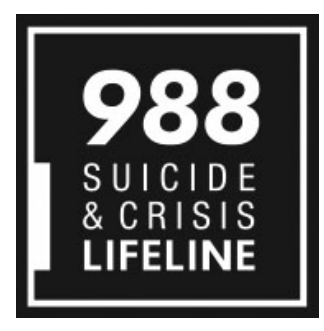
The National Suicide Hotline is available 24/7/365 to help via call or text.