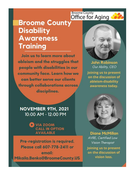
Disability Awareness Training