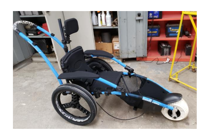
All-Terrain Beach Wheelchair Part of Pathways to Play: Dorchester Park Accessibility Improvements

Happy to Chat Bench Project (Otsiningo Park, Roundtop Picnic Area, and Deposit)