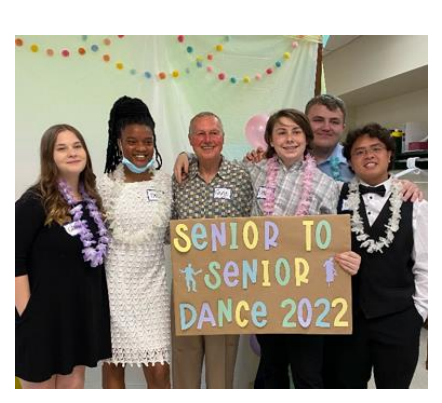
Intergenerational Dinner Dances in Vestal and Johnson City