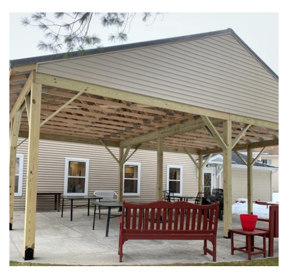
Broome West Senior Center Pavilion