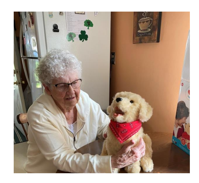
Robotic Companion Pet Project

People need accessible and affordable health services and appropriate community supports.