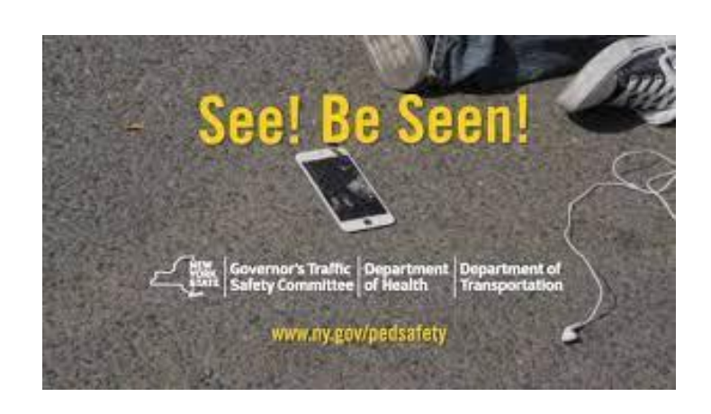
"See! Be Seen!" Public Service Announcements