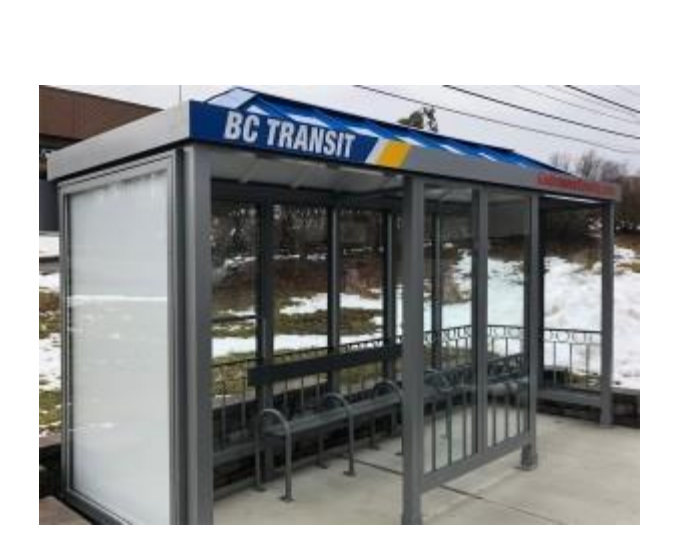
BC Transit Bus Shelters

Adequate, safe and affordable transportation is critical to an agefriendly community. Safe streets, sidewalks, and crosswalks are essential as are alternatives to driving for those who need to move around the community for access to services and for social and civic participation.